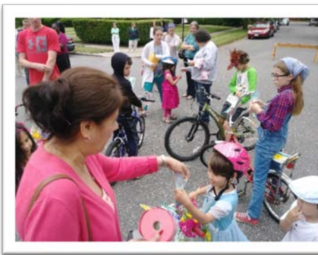
Bike Parade - Illumination Night on Bronson Terrace

76 Bronson Terrace 46 Bronson Terrace 425 Trafton Rd.